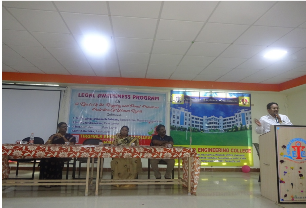
A speech by second class Magistrate of NRT at Legal Awareness Program