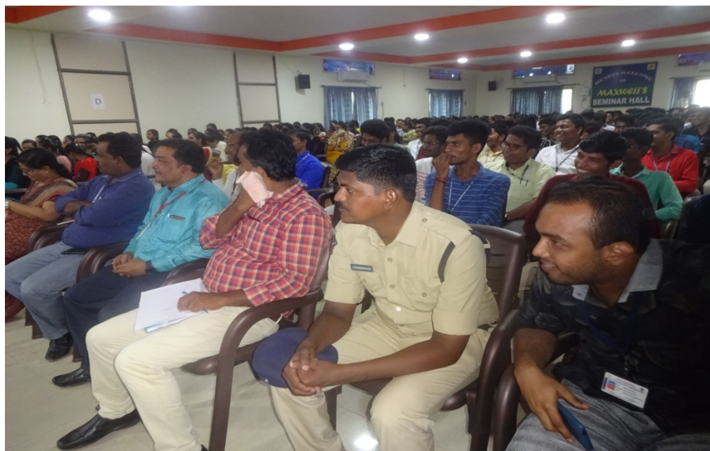
Security of Second Class Magistrate and Press Reporter