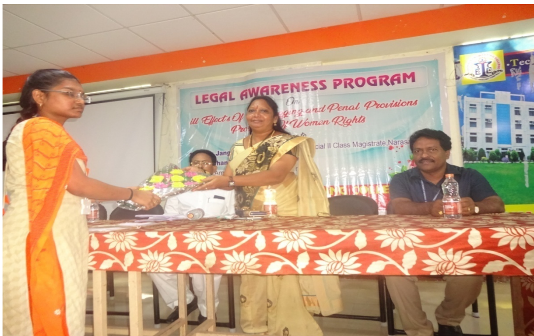
Honoring of Lawyer by girl Student