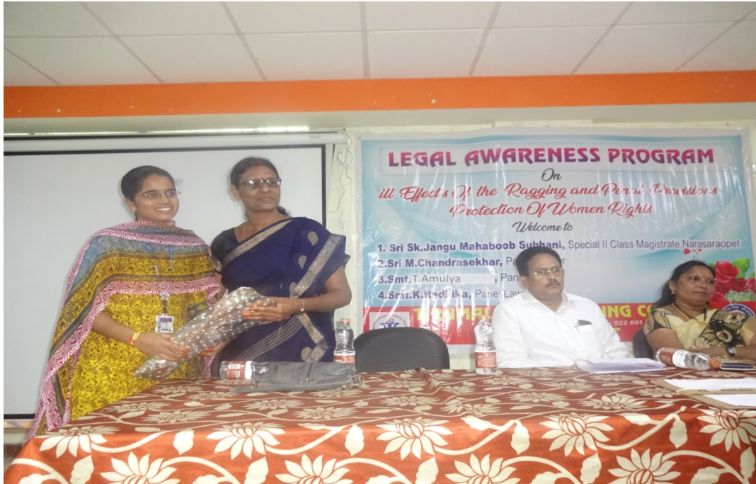
Honoring of Lawyer by girl Student