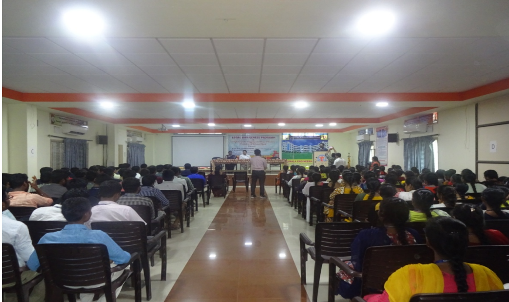
Students of TEC at Legal Awareness Program